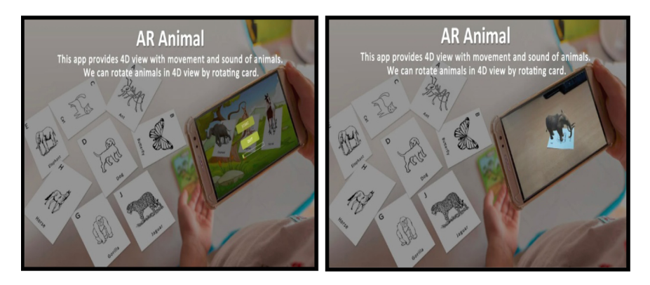
Fig. 2. AR animal application - a graph that represents how through the pictograms and using a smartphone, you can project a chosen animal using augmented reality.

AR animals is a mobile application created to teach animals (wild and domestic). Its use is free and just enter the website where they allow you to download a list of pictograms, the application can be downloaded from playstore see as an example Fig. 2.