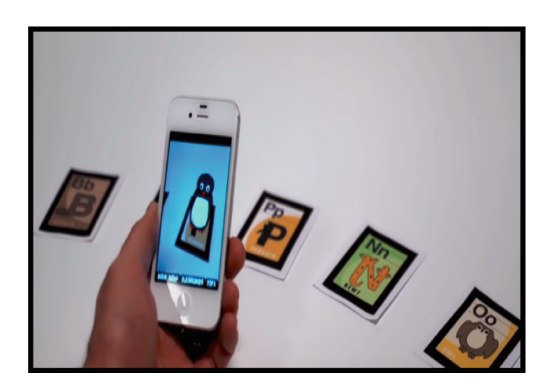
Fig. 3. Alphabet flashcards App - a graph that represents the use of the mobile application, augmented reality [31].

This mobile application was created to teach the alphabet and presents with each letter an associated animal. To be able to use it, just download it from Playstore, its use is free, and a pdf with the associated pictograms can be downloaded from the website. Its use is shown in Fig. 3 below.