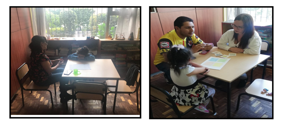
Fig. 1. Work sessions with Girl with mild autism.

Prior to the use of the applications, a small training was given to the psychologists who participated in the experiment. In addition to the first sessions they were to familiarize the girl with the technological equipment that was later used in the intervention, finally, they told the girl how to use the applications. A tablet was used in two sessions and a smartphone in the remaining two sessions; however, the specialist led the use of the application.